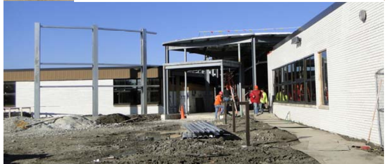
Fenton's new main entrance in late October. Steel work started and plans for pavers implemented.