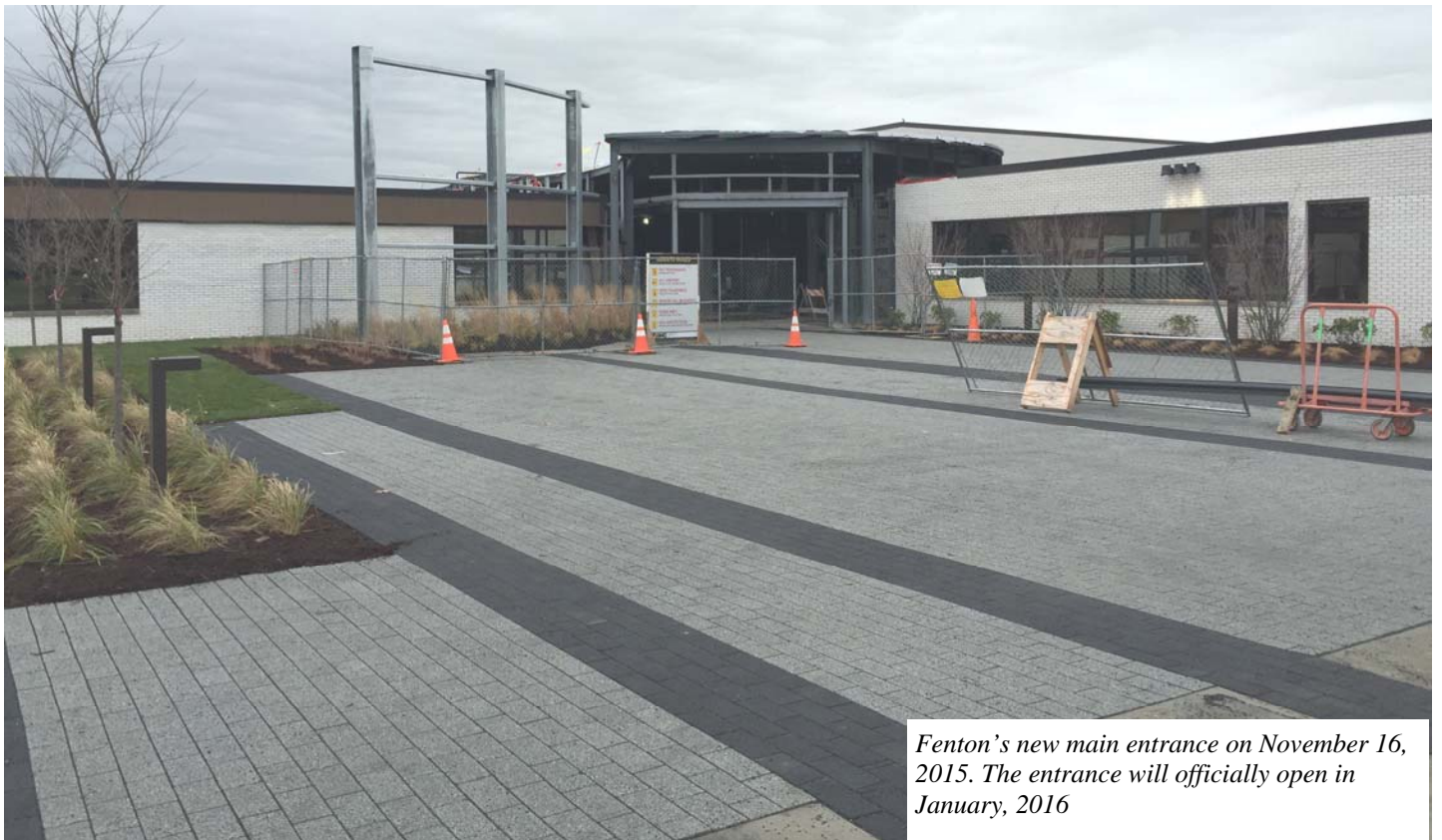
Fenton's new main entrance on November 16, 2015. The entrance will officially open in January, 2016