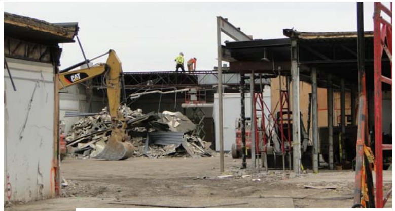
Demolition to make way for the new main entrance began in the summer and continued through October.

November was an exciting time as true progress was witnessed every day. Outside, pavers are in place and landscaping is complete. Internally, ceiling grids, dry wall and a temporary wall has been removed. A community open house is being planned in 2016 to allow everyone to see the new Fenton campus. Details will be posted to the Fenton website when they are confirmed.