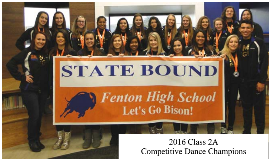
2016 Class 2A Competitive Dance Champions