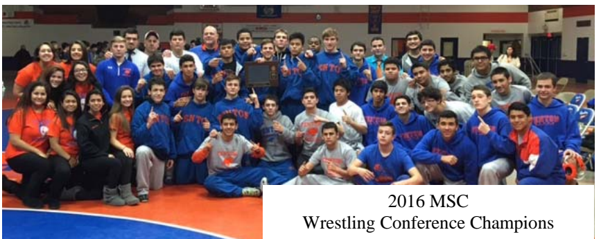
2016 MSC Wrestling Conference Champions