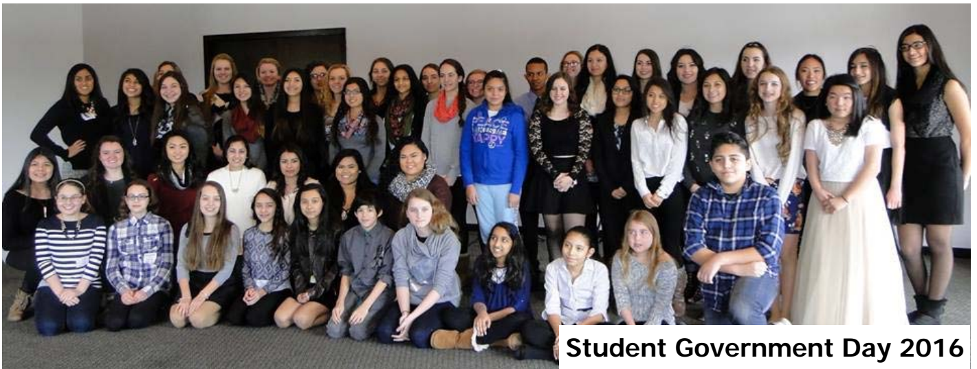
Student Government Day 2016