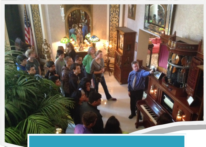
In October, Film Study students visited the Sanfilippo Mansion.